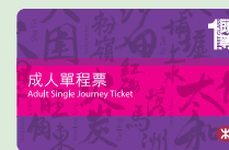
成人單程票 — 頭等

東鐵綫列車設有頭等車廂服務。使用頭等車廂的乘客必須支付頭等額外費，費用相等於該程東鐵綫車程的普通等車費。頭等單程票於東鐵綫車站內的售票機，或任何港鐵站的客務中心有售。