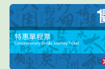
特惠單程票 — 頭等

於本港就讀的合資格全日制學生或合資格殘疾人士如欲享受特惠車費，必須使用「學生身分」或「殘疾人士身分」個人八達通，有關詳情請參閱「合資格學生港鐵八達通車費表」或「長者及合資格殘疾人士公共交通票價優惠計劃港鐵八達通車費表」。