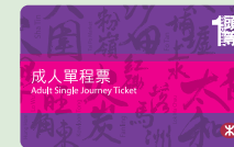
Adult Single Journey Ticket – First Class

First Class Service is available on the East Rail Line. Passengers may enjoy the First Class Service by paying a premium equivalent to the Standard Class Fare of the East Rail Line journey. First Class Single Journey Tickets can be purchased from Ticket Issuing Machines in East Rail Line stations or from Customer Service Centre in any MTR station.