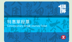
Concessionary Single Journey Ticket – First Class

Eligible full-time students studying in Hong Kong or eligible persons with disabilities wishing to enjoy concessionary fares must travel by a Personalised Octopus with “Student Status” or “Persons with Disabilities Status” respectively. For details, please refer to the “MTR Octopus Fare Chart for Eligible Students” and “MTR Octopus Fare Charts for the Public Transport Fare Concession Scheme for the Elderly and Eligible Persons with Disabilities”.