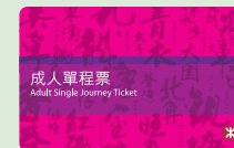
Adult Single Journey Ticket

Concessionary Tickets are available for children aged 3 to 11 and senior citizens aged 65 or above. Students aged 12 and above travelling with Single Journey Tickets are required to pay full adult fare.