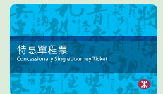
Concessionary Single Journey Ticket

First Class Service is available on the East Rail Line. Passengers may enjoy the First Class Service by paying a premium equivalent to the Standard Class Fare of the East Rail Line journey. First Class Single Journey Tickets can be purchased from Ticket Issuing Machines in East Rail Line stations or from Customer Service Centre in any MTR station.