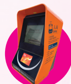
入站收費器 Entry Fare Processor