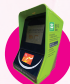
出站收費器 Exit Fare Processor